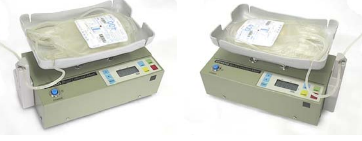
Clamp module can be mounted at the left or at the right.